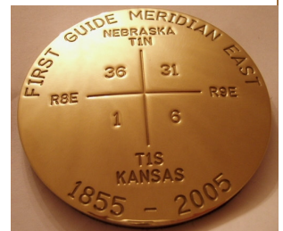
Commemorative Brass Paperweight