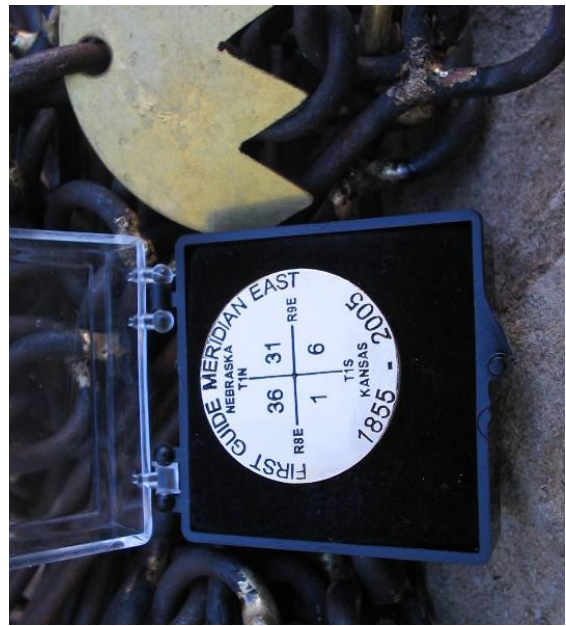
THE COMMEMORATIVE LAPEL PIN